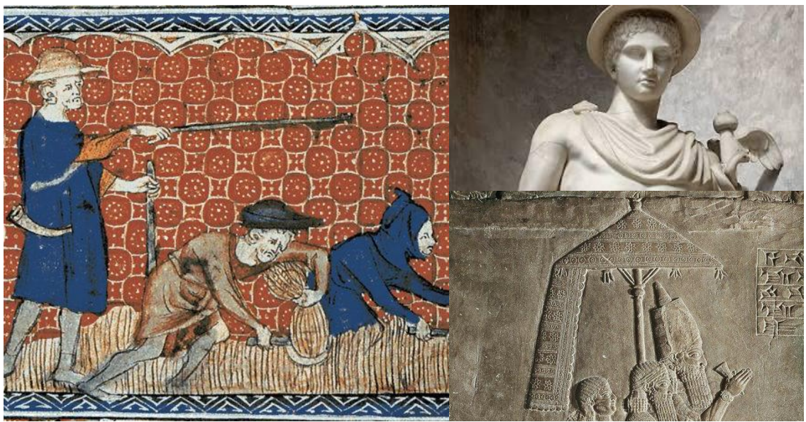
Left to Right: Queen Mary Psalter (fol.78v), c.1310, various hats; Roman statue of Hermes with petasos hat and cloak for protection when traveling; relief depicting the chariot of King Assurbanipal 669-626 BC, parasol as seen.