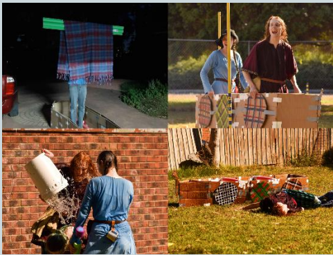
It would be a loss if you didn’t come to Return of the Kraken!

More information: https://kraeglas.lochac.sca.org/