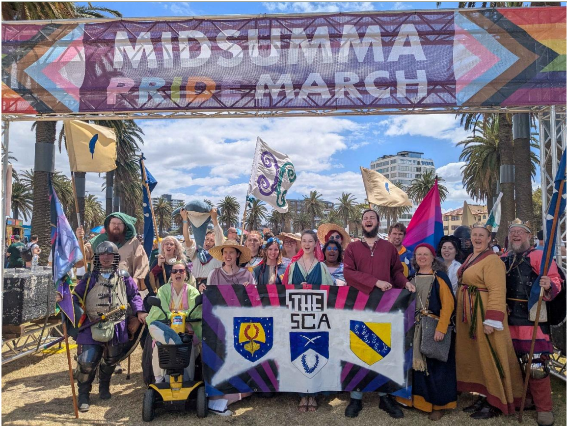
Members of Krae Glas, St Monica, and Stormhold at Midsumma Pride 2026, after marching. This was the first Pride for some of us, and the ~20 th Pride for others!