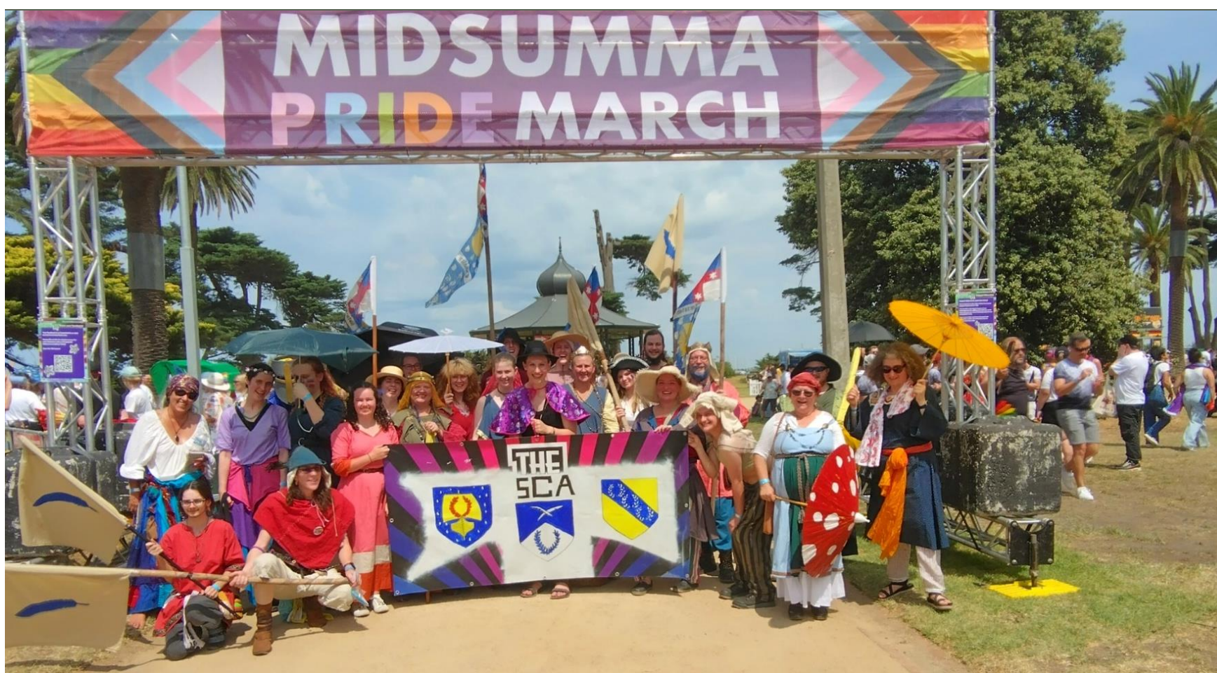
The Barony of Krae Glas, the Barony of Stormhold, and the College of St Monica after completing our march in Pride, February 2 nd , 2025.