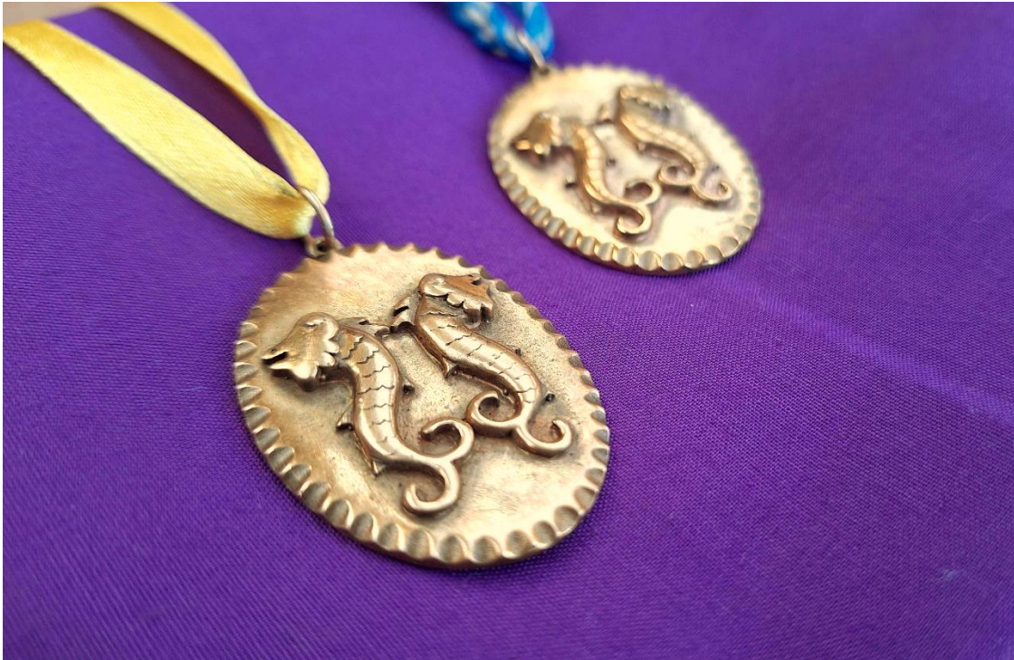
The previous tokens for the Baronial Endorsement, made from bronze, depicting two dolphins endorsed. This token now costs the Barony $30 to obtain, which is too expensive.