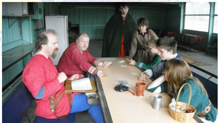
Learning card games.