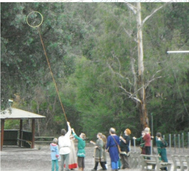
Hula hoop hunting

There was also a Hunt for the dreaded dragon. It had been terrorising Clifford park, and scaring hula hoops up trees. The Dragon was hunted down and felled with a rain of arrows. It's punctured hide was displayed in the Feasting hall, so all could tell of their mighty deeds.