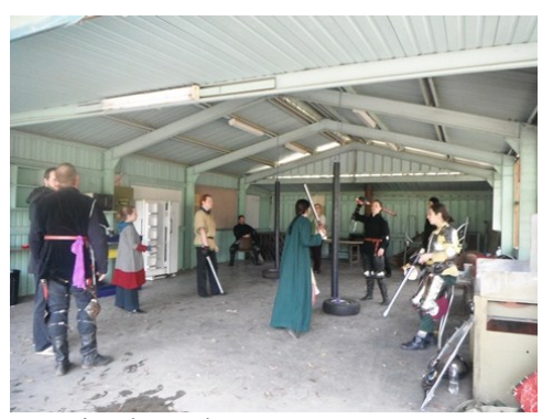
Eva's Advanced power generation concepts.