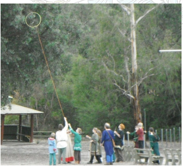
Hula hoop hunting

There was also a Hunt for the dreaded dragon. It had been terrorising Clifford park, and scaring hula hoops up trees. The Dragon was hunted down and felled with a rain of arrows. It's punctured hide was displayed in the Feasting hall, so all could tell of their mighty deeds.