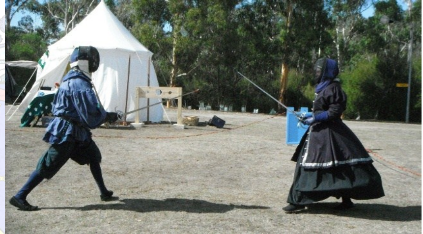
Final round of the Princess Bride Tournament.

A big part of the Saturday was the Archery. Anyone could join in, as non-living targets were being shot. People brought their bows, or borrowed one and were seen wandering through the trees